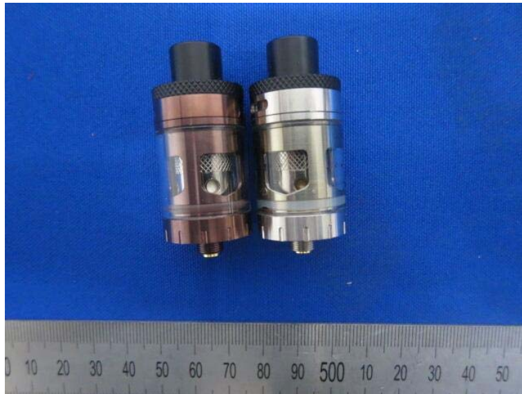
DIGIFLAVOR WildFire Sub Ohm Tank