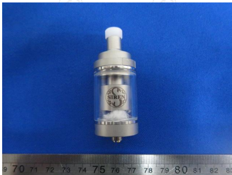
DIGIFLAVOR Siren 2 24mm