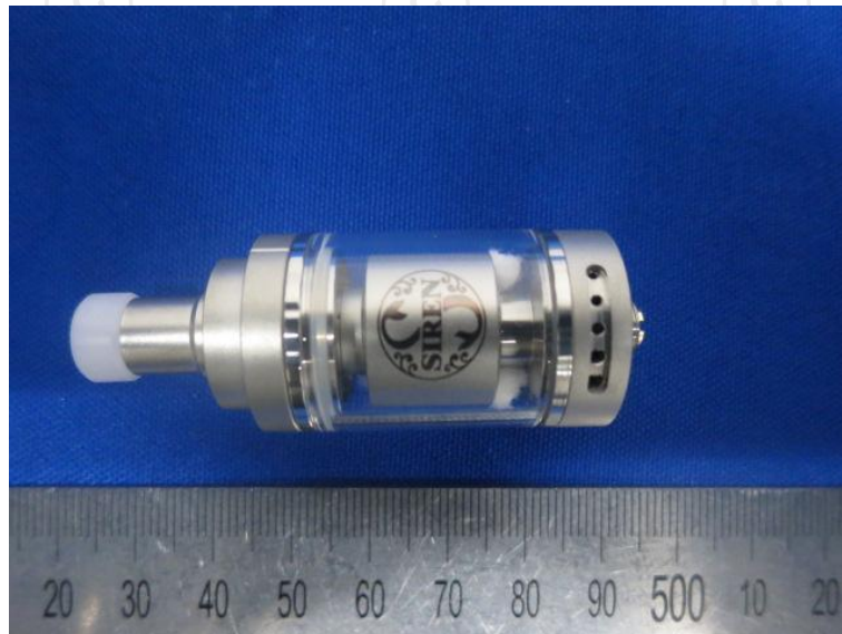
DIGIFLAVOR Siren 2 22mm