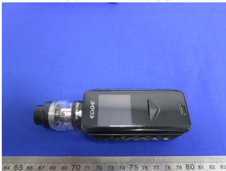
DIGIFLAVOR EDGE KIT