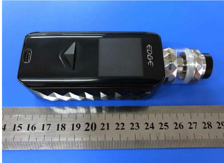
DIGIFLAVOR EDGE KIT 2ML