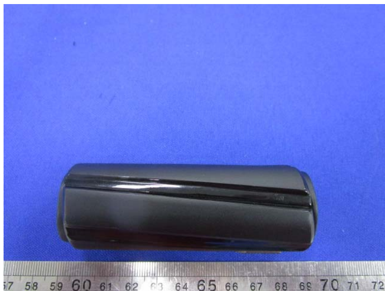
DIGIFLAVOR HELIX MOD