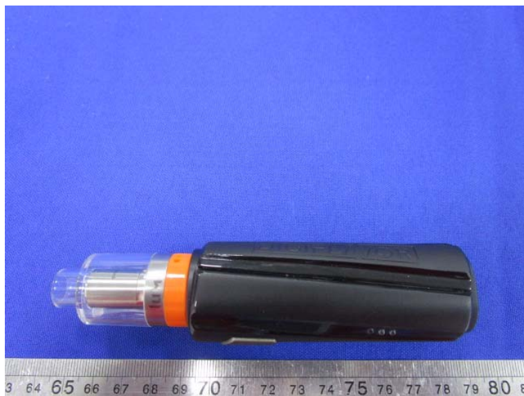
DIGIFLAVOR HELIX KIT